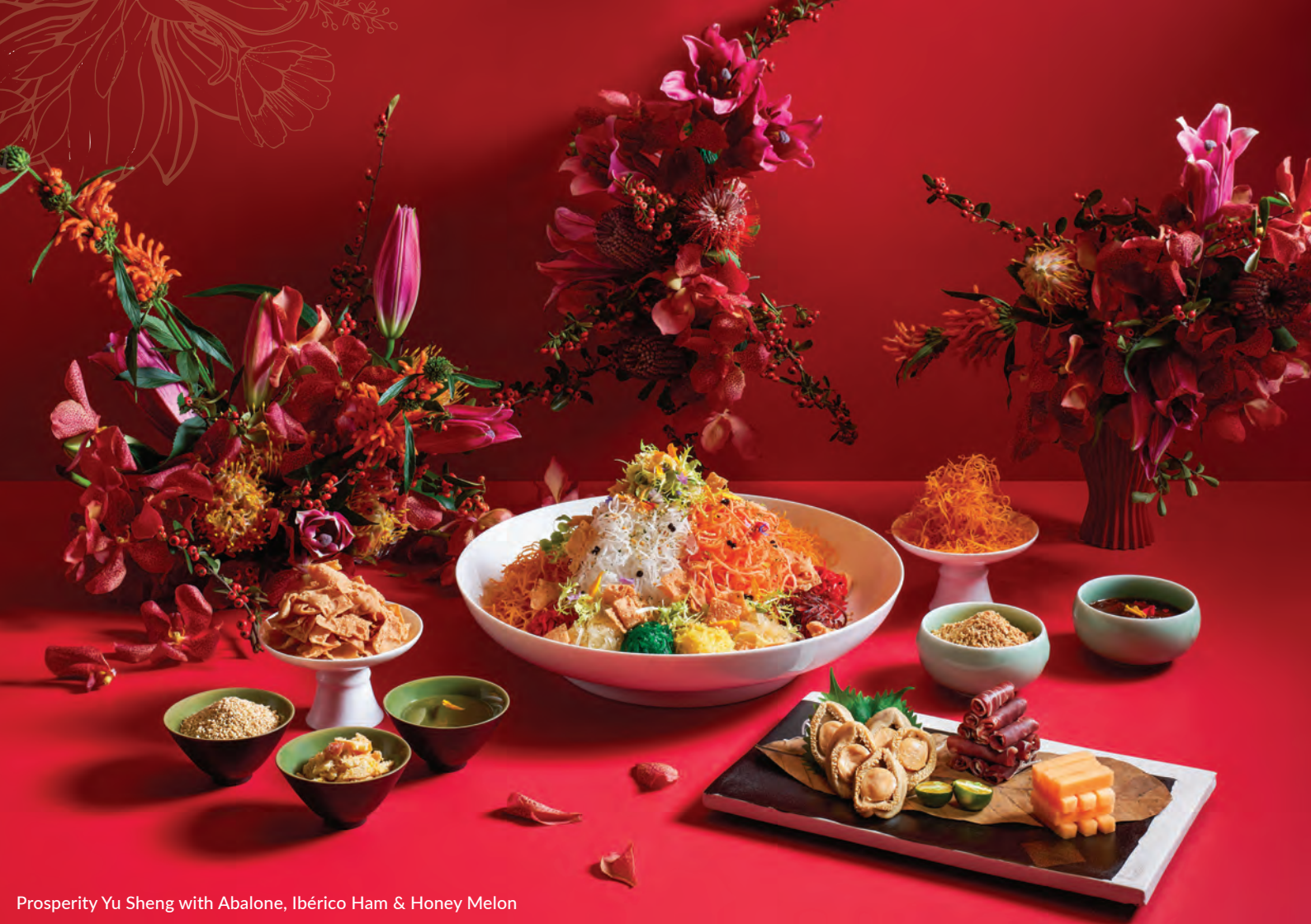
Prosperity Yu Sheng with Abalone, Ibérico Ham & Honey Melon