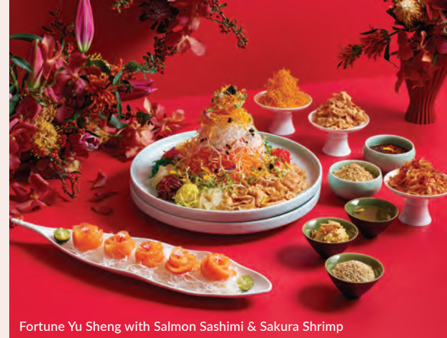
Fortune Yu Sheng with Salmon Sashimi & Sakura Shrimp

All stated prices are in Singapore Dollars and subject to 10% service charge and prevailing 9% goods and service tax, unless otherwise stated.